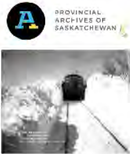
PAS Photo S-B12751 - Snow storm 1927

Contact all.sas@sasktel.net for information about our chapter, the ZOOM link and to join APSAS.